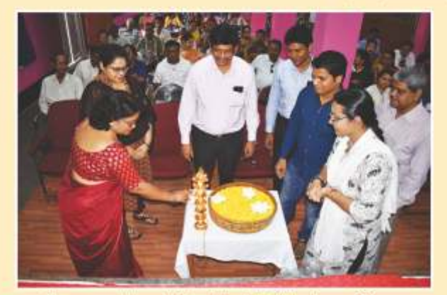
Inauguration of the Health Check-up Camp