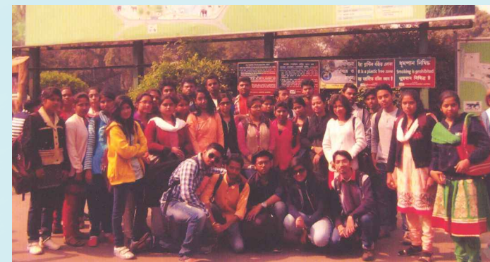
Field Work - Alipore Zoo