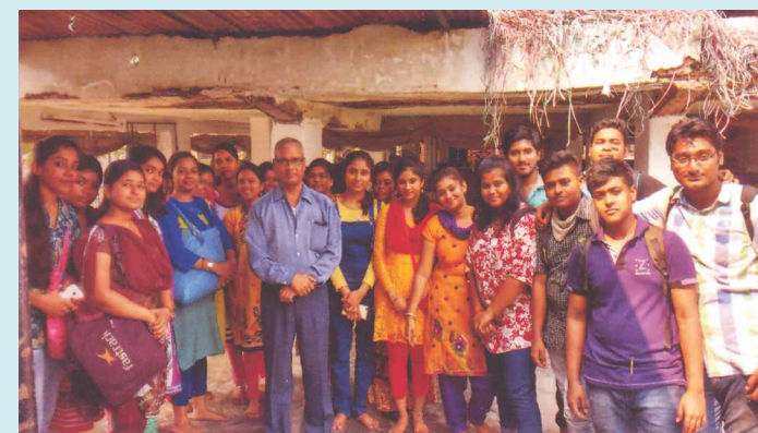
Hatchery 3rd Year