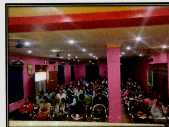
OFFLINE STUDENT SEMINAR