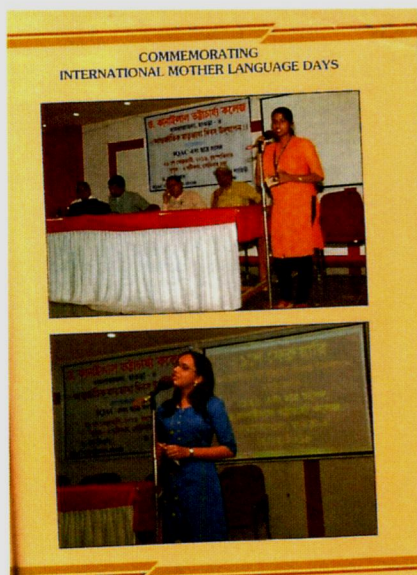
INTERNATIONAL MOTHER LANGUAGE DAY (PERFORMANCE BY STUDENTS)