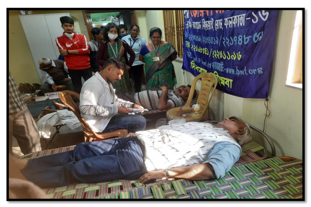
Blood Donors at The Camp