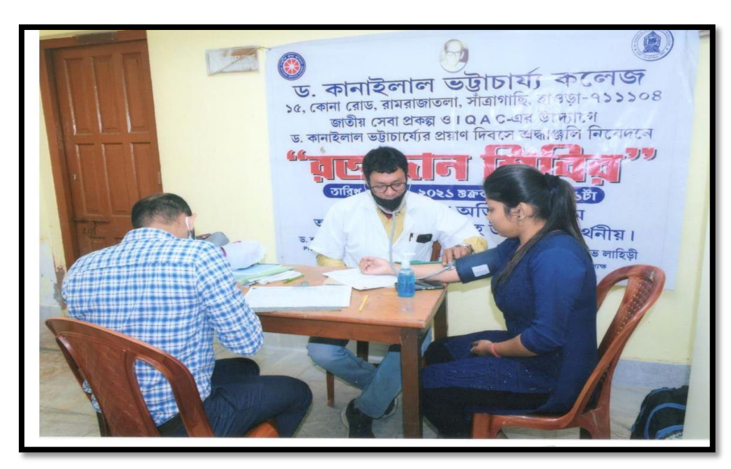
Doctor Checking Blood Pressure Before Blood Donation