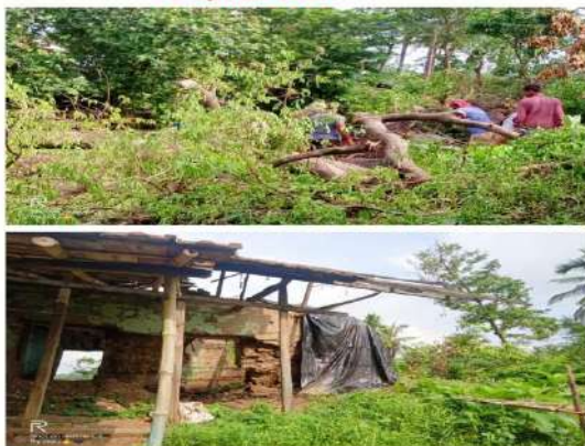
environment damaged by amphan storm