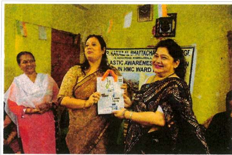
Plastic Awareness Campaign HMC Ward No.27