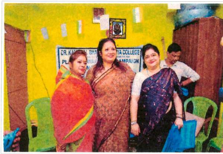
Plastic Awareness Campaign HMC Ward No.27