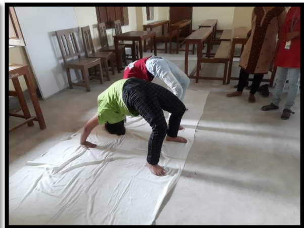
NSS Volunteers Demonstrating Yoga in the Classroom on World Yoga Day