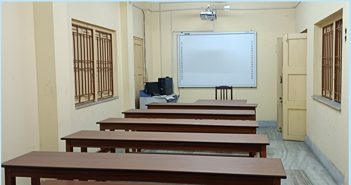
ICT Enable Class, (New Building)