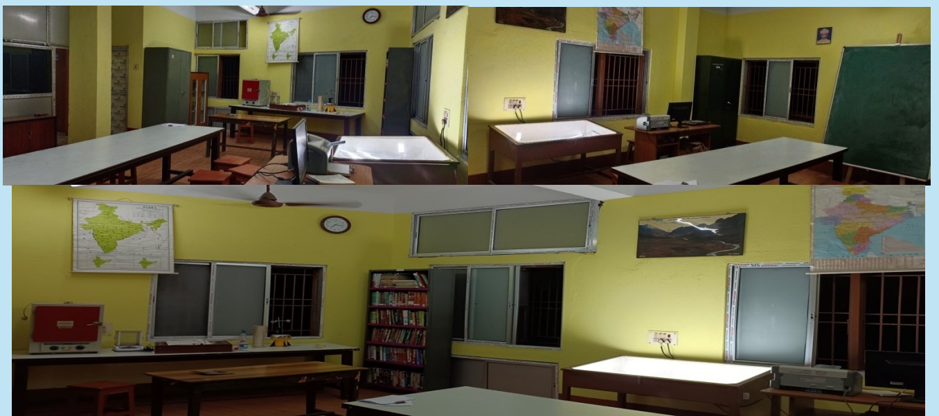
Soil Laboratory and Seminar Library