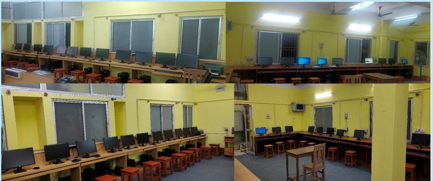
RS & GIS Laboratory